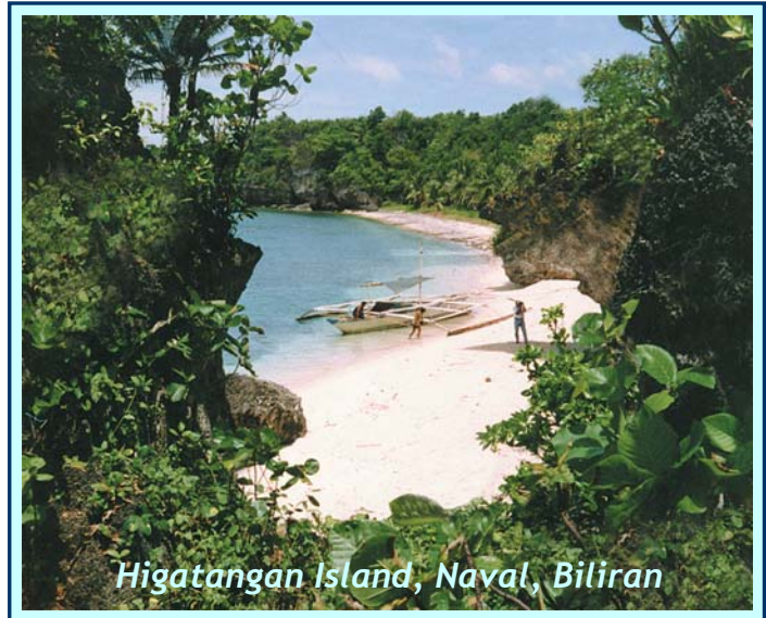
Higatangan Island, Naval, Biliran

Naval is home to the amazing Higatangan Island, famous for its moving sand bar and rock formations.